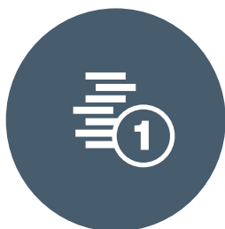
BANKING & FINANCE

Known for our international expertise and detailed knowledge of the local legal and business environment, we act for a wide range of Slovak and multinational clients and play a leading role in complex transactions. Our reputation in the country is built on the blend of global and local knowledge we offer, combined with high quality services and commitment.